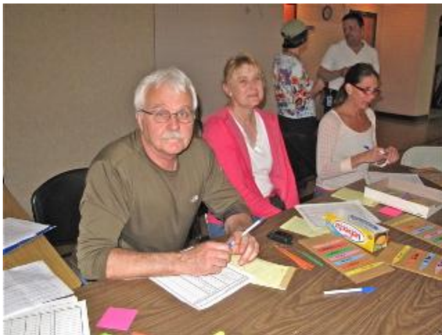
Some of our newer members staff the cashier desk. Thank you!